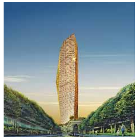
TRUMP TOWER MUMBAI Mumbai's glittering jewel with a striking gold facade.