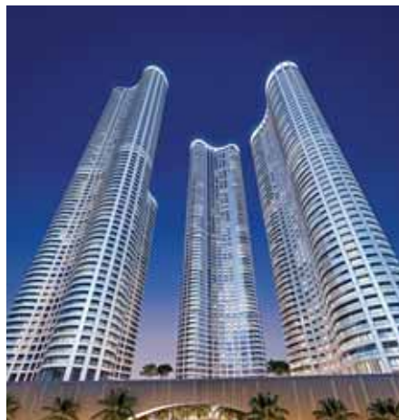
THE WORLD TOWERS One of India's most iconic addresses.