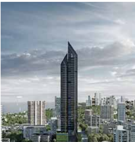
LODHA ALTAMOUNT India's finest residences on Mumbai's Billionaires' Row.

When you buy a home with us, what you get is a well-planned ecosystem that caters to all the desires that you may have as a home owner. You will experience a holistic lifestyle with spacious homes, well-crafted open green spaces, avenues to lead an active life, world-class service, access to basic conveniences and the comfort of community living.